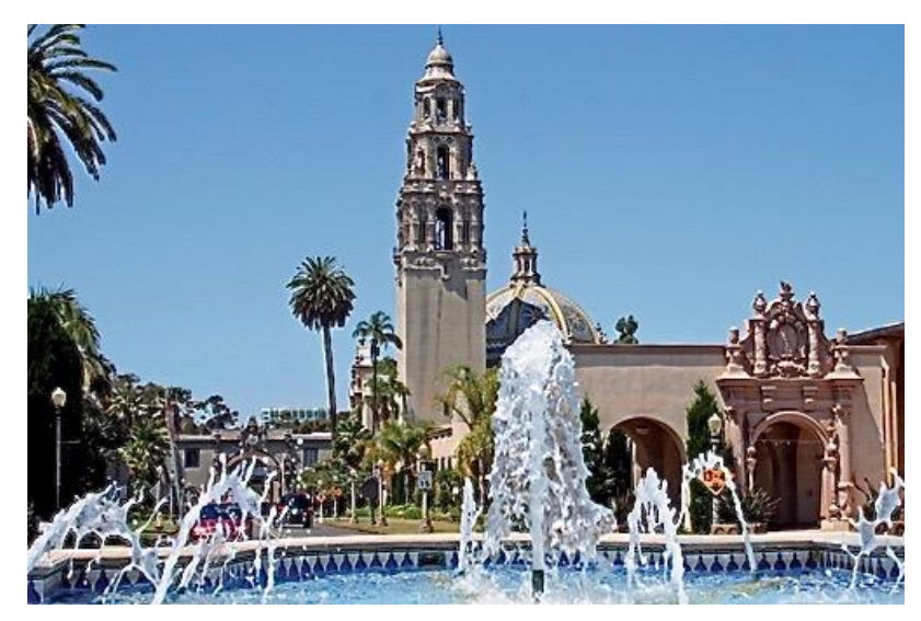
Photo of Balboa Park fountain courtesy of San Diego Tourism Authority

Spring is in the air in the northern hemisphere, which means flowers are blooming, people are planning family gatherings outdoors (covid-19 restrictions permitting), and the semester is drawing to a close in some parts of the world.