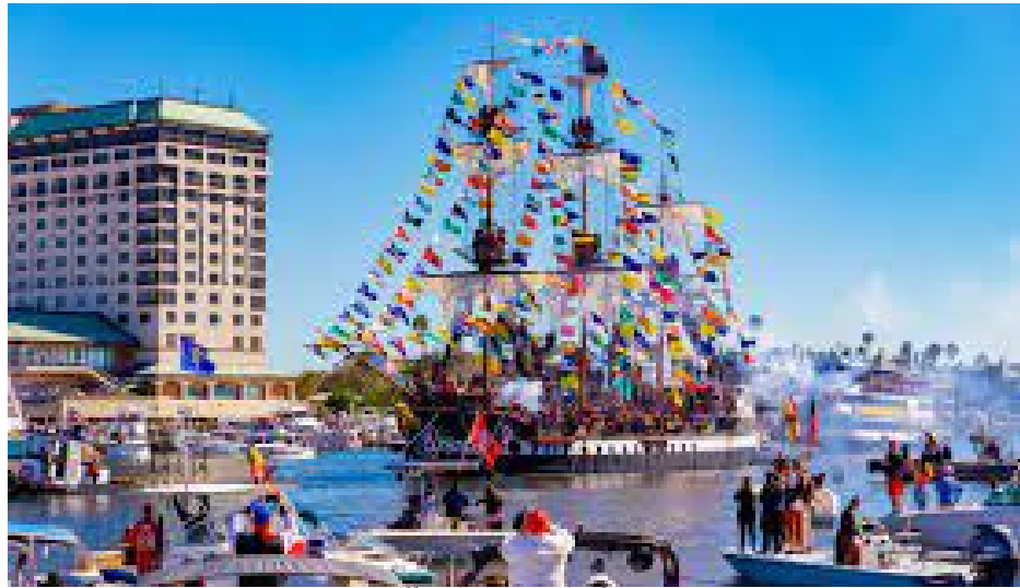
Gasparilla Pirate Festival - Tampa, FL

Avast ye! Submit your presentation, panel, or poster by March 30. Find Submission Guidelines with samples and the submission link on the conference page .