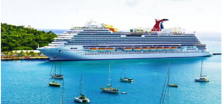
© 2019 Carnival Corporation. Carnival® and the Carnival logos are trademarks of Carnival Corporation.

The registration for the ABC Western region Baja cruise conference on March 1-5, 2020 is now underway. If you have not submitted a proposal for the Western ABC Conference but are interested in attending the conference, please register by October 15 to secure early bird discounted registration fees: <u>https://www.businesscommunication.org/page/2020-abc-western-u.s.-</u>conference#Registration.